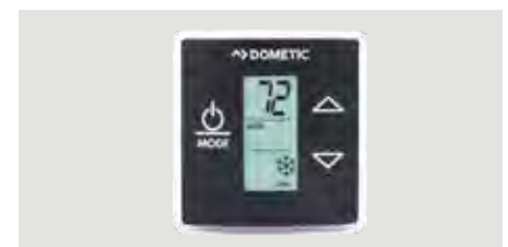
CT Single Zone Thermostat