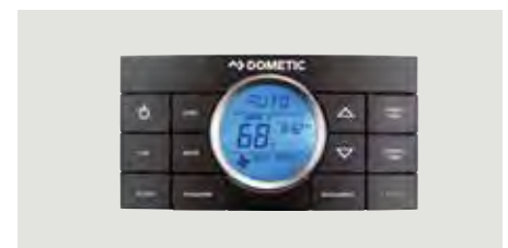
Comfort Control Center II