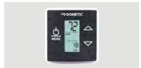
CT Single Zone Thermostat