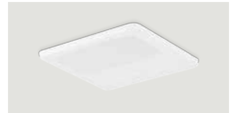
Quick Cool Return Air Package