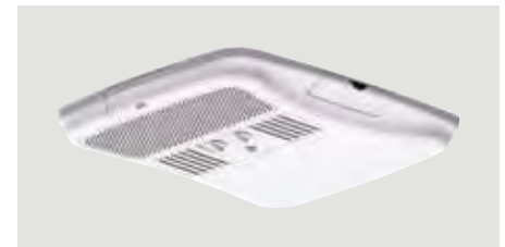
Air Distribution Box (ADB)