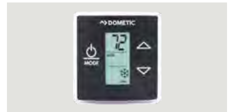
CT Single Zone Thermostat