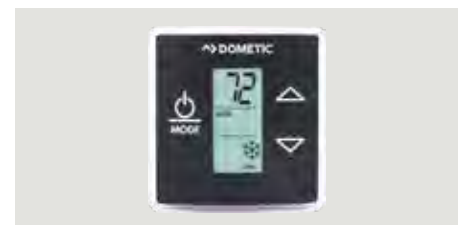
CT Single Zone Thermostat