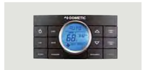
Comfort Control Center II