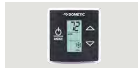
CT Single Zone Thermostat